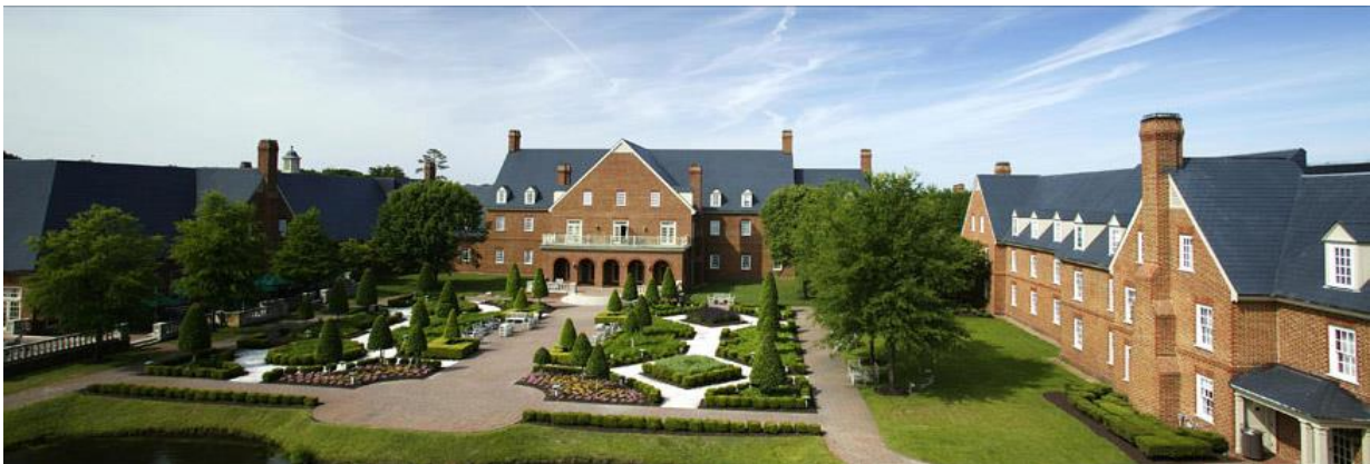
The Founder's Inn and Spa in Virginia Beach. Site of the 2014 VAHPERD Convention

Plan to attend the 77 th VAHPERD Convention November 6-9, 2014 Founders Inn and Spa Virginia Beach, Virginia